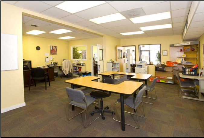
Interior of the premises, facing West Portal Avenue