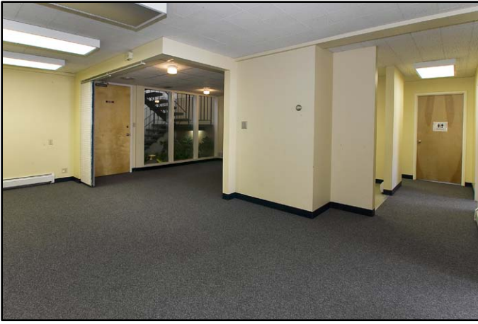
Interior of property, facing southwest